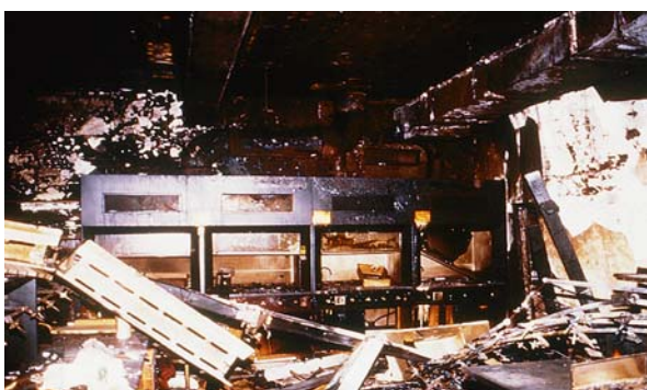
Cal State North Ridge (1994): lab gutted by fire after quake – note fume hoods on back wall. Mixing of incompatible chemicals caused fire. This may have been prevented by proper segregation of incompatibles.