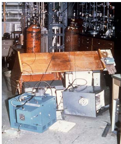
UCSC (1989): unsecured equipment fell to floor.