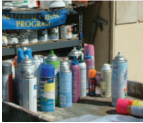
AEROSOLS AND ADHESIVES

These are some of the items accepted at the Community Hazardous Waste Collection Center. See the list inside for Business Disposal Rates.